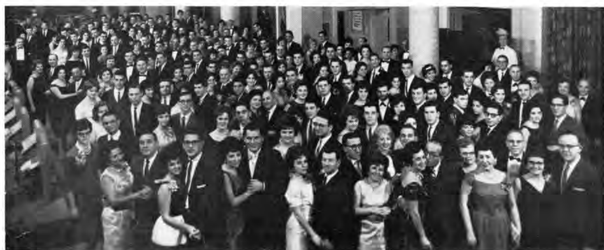
Part of the crowd in attendance at this year's Annual 3rd District Christmas Dance held December 2 at the Penn Top of the Statler Hilton in New York City.

Alpha Phi Delta Fraternity 1459 Woodruff Ave. Pittsburgh 20, Penna.