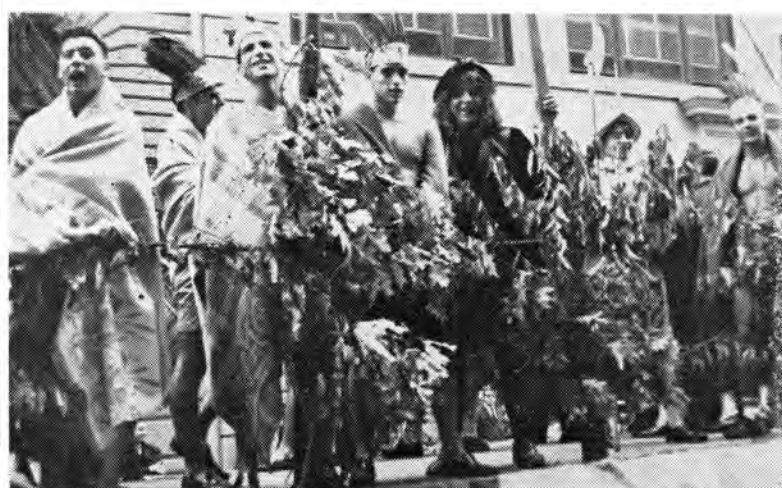
The Alpha Phi Delta Third District contingent at the annual Columbus Day Parade on New York City's Fifth Avenue.